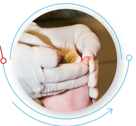
Perfect for pediatric samples