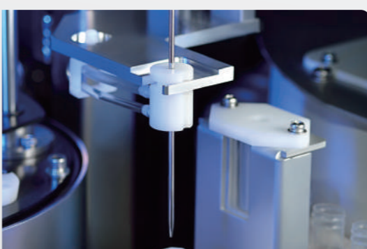
Wiper washing technology Enhance efficiency and minimize carryover