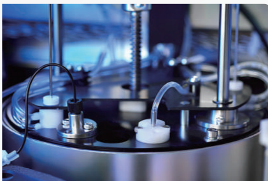
Precise magnetic separation with consistent performance reliability