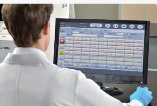
Intuitive software interface Easy access to all functions