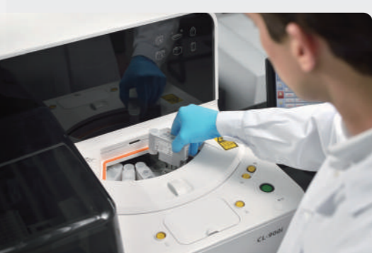
Continuously loading of reagents and consumables