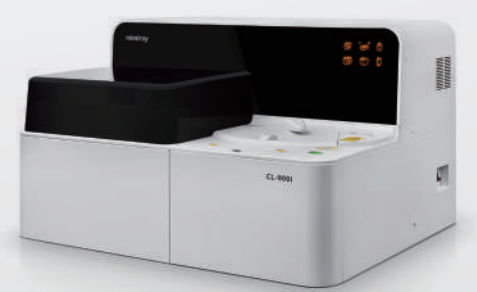
Intelligent consumables management