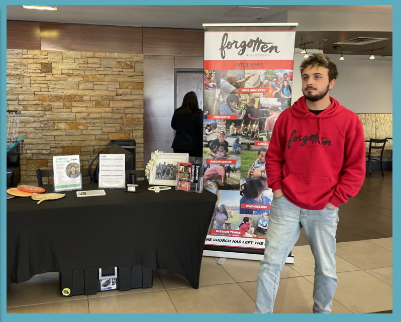
Romans 12:1 "Therefore, I urge you, brothers and sisters, in view of God's mercy, to offer your bodies as a living sacrifice, holy and pleasing to God—This is your true and proper worship."

I now lead the college intern program and help out with our kids program. The drive and motivating factor in my life is the fact that before Christ, I was nothing. Every ounce of worth and purpose came from Him, which compels me to live in obedience to the call He has on my life to share the gospel with no regards to self. Therefore, following the example of love that Christ displayed through his life, death, and resurrection.